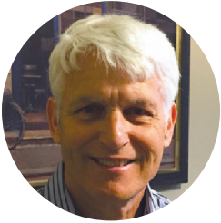
The Hon. Justice Rick Libman Ontario Court of Justice